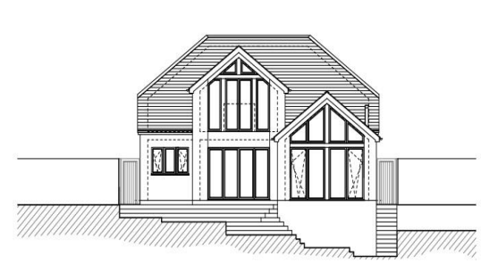
Proposed East Elevation (